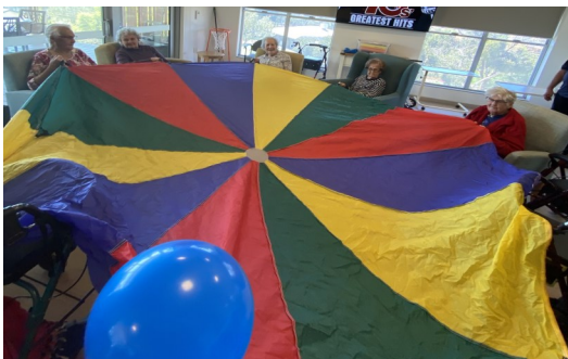
Then we got out the parachute and tried to move the balloon.